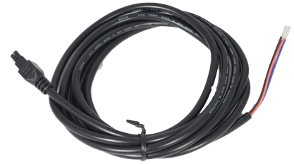
Part Number: 170585-000 MSRP: $14.49

Output Pin – The Output Pin can be used to allow an external device to read either whether the router is running or whether the modem is connected. Select one of the following options from the dropdown menu: