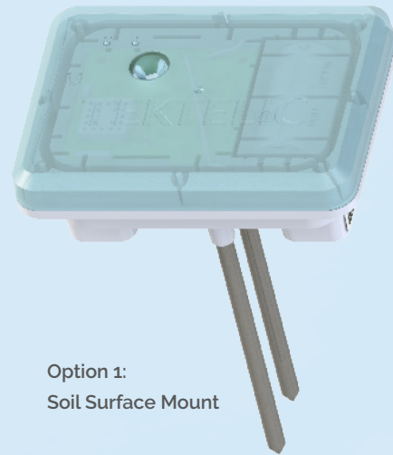
Option 1: Soil Surface Mount

Multiple variants for diverse mounting options are available including direct soil surface mount or elevated mounting on a post, fence or vine. Soil Moisture probes are sold separately for the elevated mounting variant.